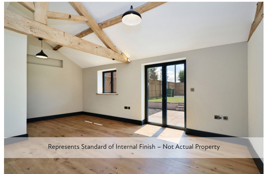
Represents Standard of Internal Finish – Not Actual Property