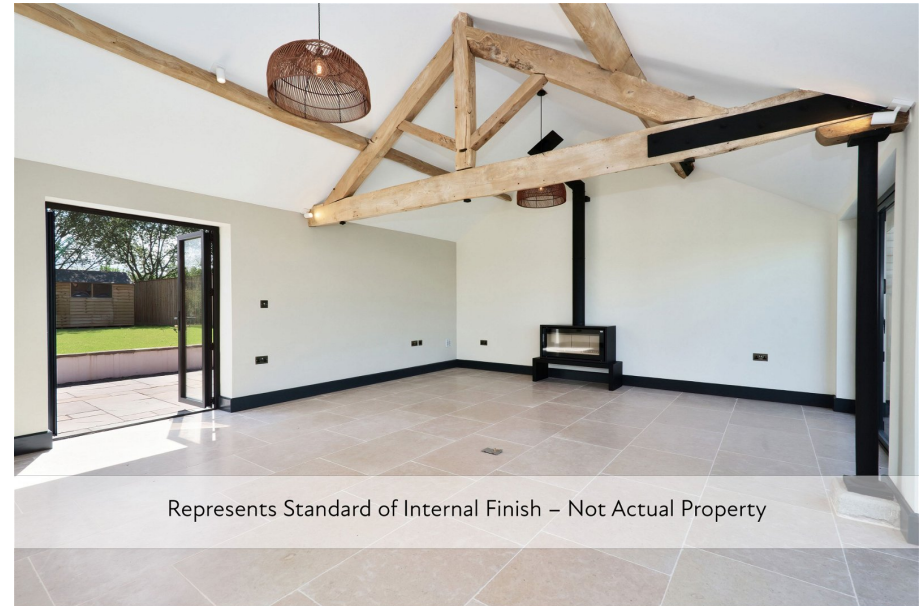
Represents Standard of Internal Finish – Not Actual Property