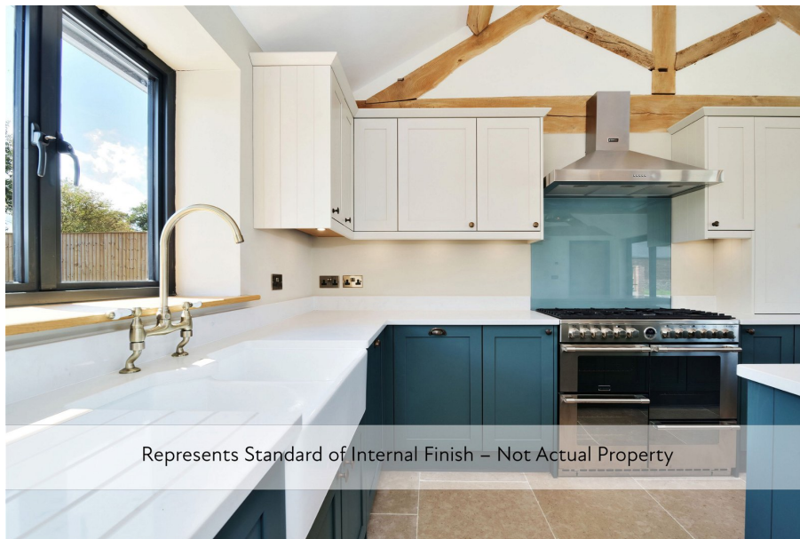
Represents Standard of Internal Finish – Not Actual Property