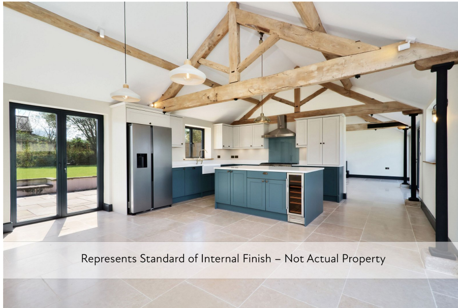
Represents Standard of Internal Finish – Not Actual Property